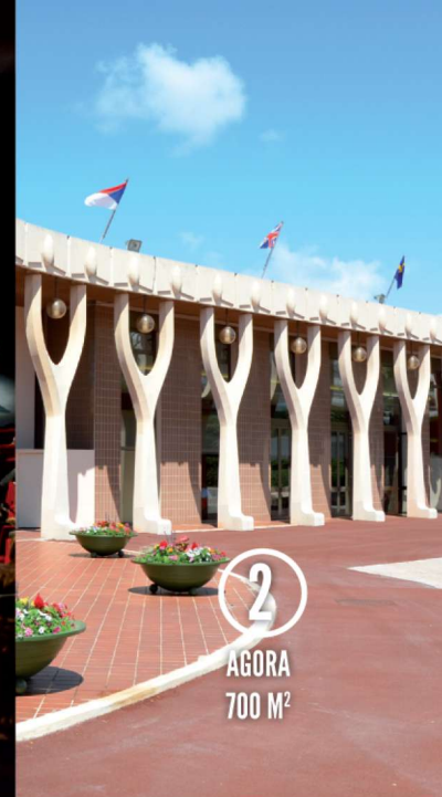
2 AGORA 700 M 2