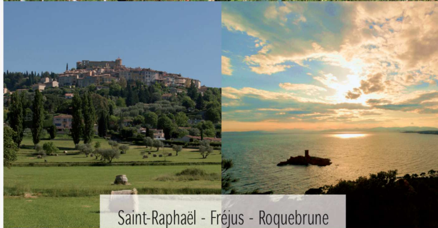
Saint-Raphaël - Fréjus - Roquebrune Puget sur Argens - Pays de Fayence