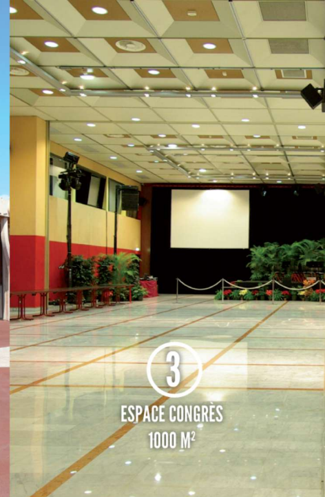
3 ESPACE CONGRÈS 1000 M 2

Located at the Santa-Lucia leisure port, 1 km from the city centre, this versatile Convention Centre can easily be adapted to your meeting configuration, be it a congress, convention, general assembly, trade fair, etc.