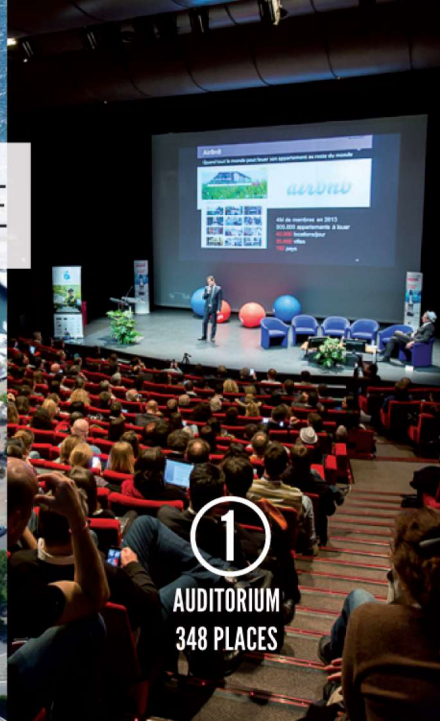
1 AUDITORIUM 348 PLACES